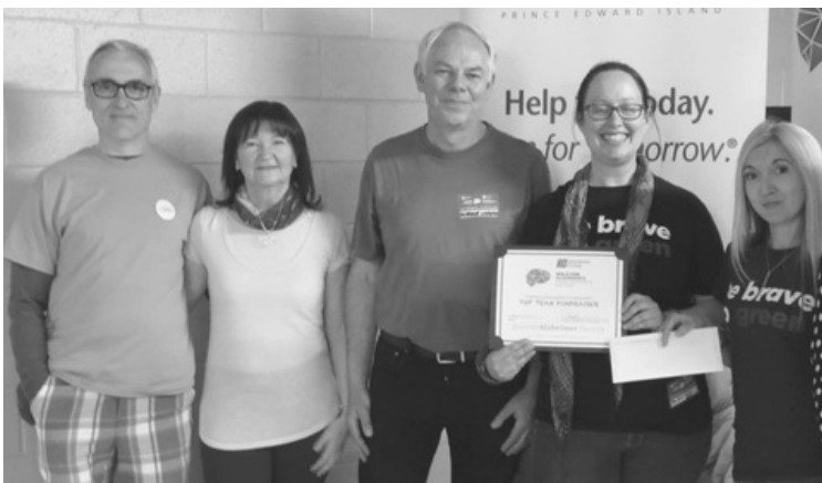
Summerside Walk for Alzheimer's fundraising event.

The Office of the Third Party is located in attic of the historic J. Angus MacLean Building, 94 Great George St.